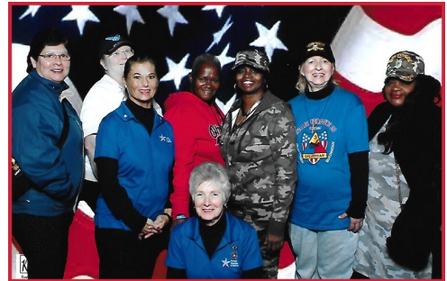
WVI Members