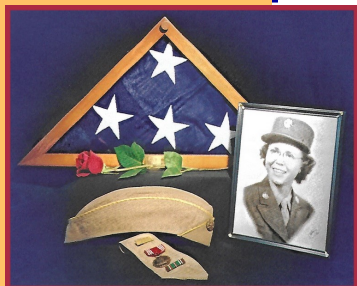
F. Ausenbaugh, Cpl., US Army Corps

16,000,000 Americans served during WWII of which 2.5 percent were women. The stories of the women that served have rarely been told or published. Author, Peg Trout (Navy) became interested in the women of WWII through a photography course assignment.